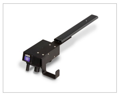
Under Counter Bag Tee Slide Mount 2037-M