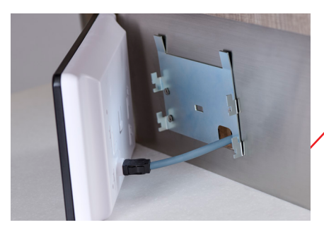
Easy installation with mounting bracket and 1-1/8" hole cut-out

At 5.3" H x 9.2" W x 1.5" D, the Porter Midas<sup>TM</sup> touchscreen is ideal for tight cabinet spaces and easy to install for a wide variety of cabinets.