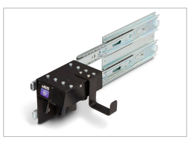
Left / Right Bag Tee Slide Mount 2036-M